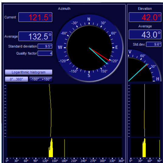
Example showing azimuth and elevation of sky wave on HF band

There is also an integrated digital recorder, making it possible to instantly record and playback the received signal, both at the IF and audio levels, for all three receiver channels.